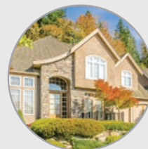
PEACE OF MIND